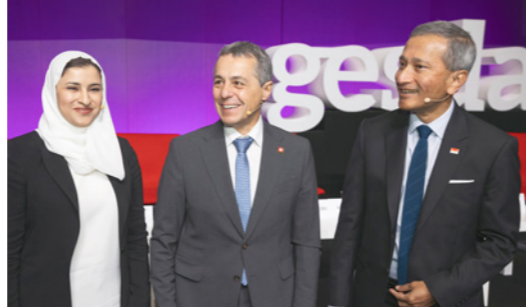
Federal Councillor Ignazio Cassis, overseeing GESDA within the Swiss government, surrounded by Ms Sarah Bint Yousif Al Amiri, Minister of State for Education and Advanced Technologies of the United Arab Emirates, and Mr Vivian Balakrishnan, Minister of Foreign Affairs of Singapore, during the political segment of the 2022 Summit.